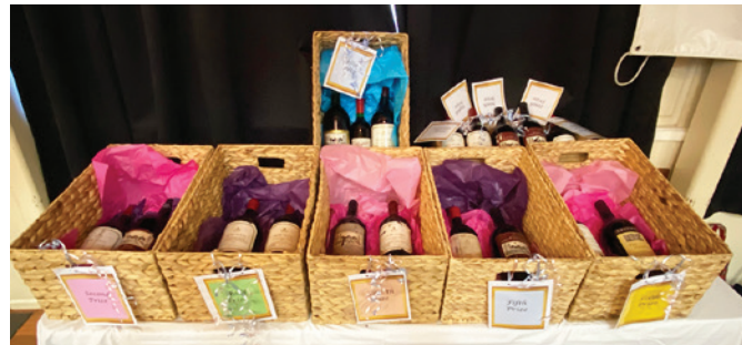
Wine raffle prizes