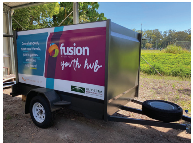
Compass - Mobile Youth Hub