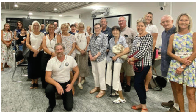
DV Safe Phone team and guests

With so many people affected by domestic violence (estimated at two million Australians), it's wonderful that the Buderim Foundation has been able to support DV Safe Phone in such an important initiative.