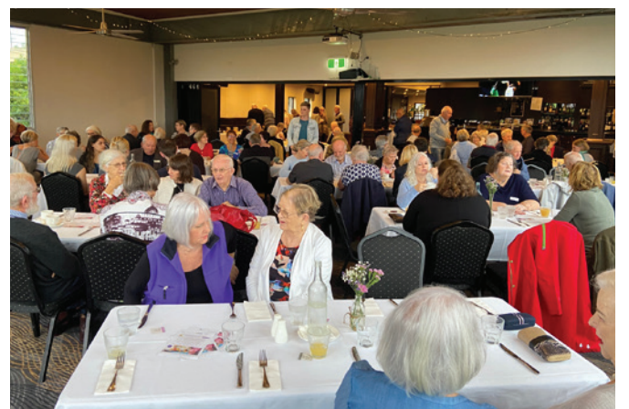
Breakfast at Buderim Tavern