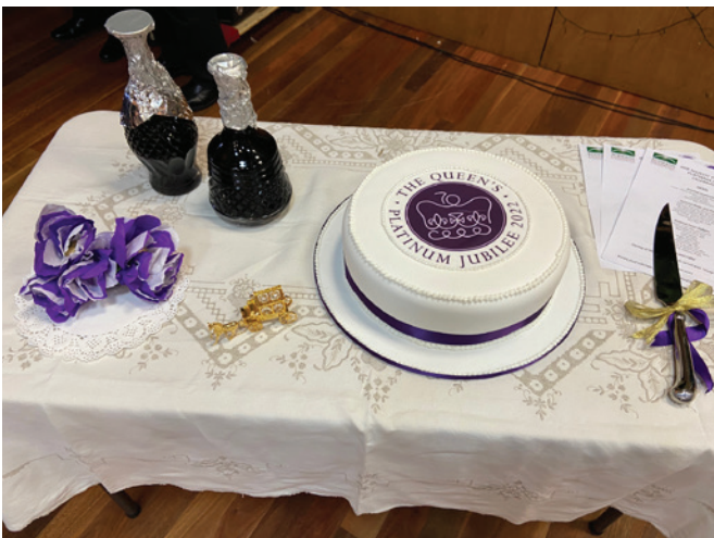
Jubilee Cake with Stump Block Port

A big thank you to the Events Committee for organising and delivering such an enjoyable and important function, as well as all the other volunteers who helped out. So many people contributed to the success of the Luncheon: those who made the delicious food, those who set up the Hall the night before and dismantled everything afterwards, those who made special decorations for the tables, those who worked in the kitchen before and during the function, those who served drinks and those who cleared and cleaned up afterwards.