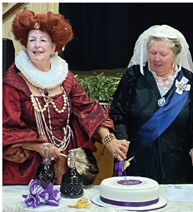
"Queen Elizabeth 1" and "Queen Victoria"