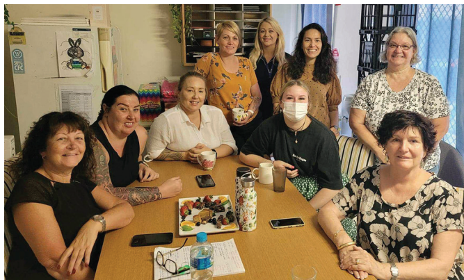
Some of the SunnyKids front line team

long-term rental and living together in their car. Because of this stability, the children continued to attend school, and the father was able to continue working, while they found temporary accommodation. Over 20 families have received food vouchers and other support. SunnyKids has supported 62 families so far as a direct result of the funds.