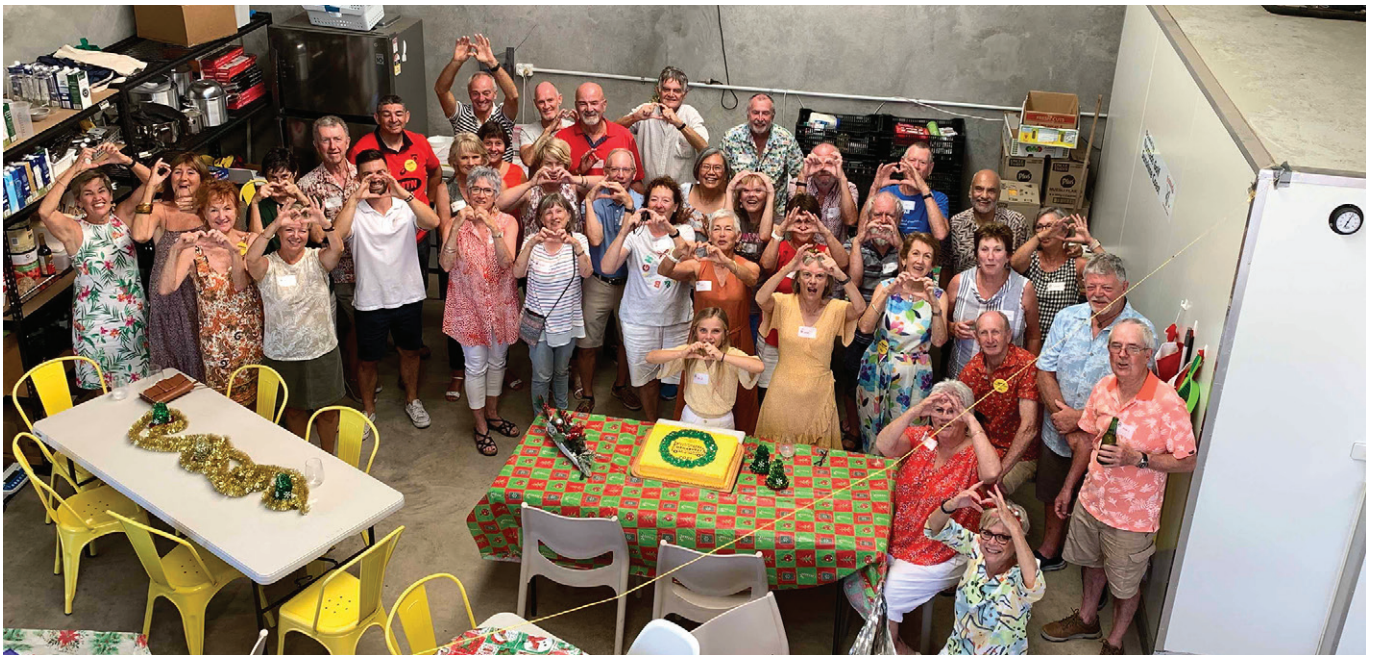
OzHarvest Yellow Army of volunteers