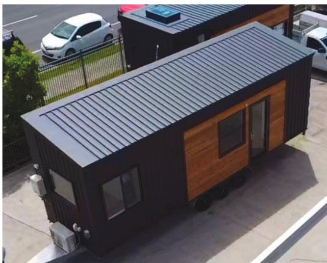
Youturn's Tiny Home

The tiny homes will provide supported accommodation over three month periods to young people aged 16-24 years (and any dependents) who are at-risk of homelessness within the Noosa area. Tenants will also be trained in life skills such as learning to drive, permaculture, budget cooking and shared living.