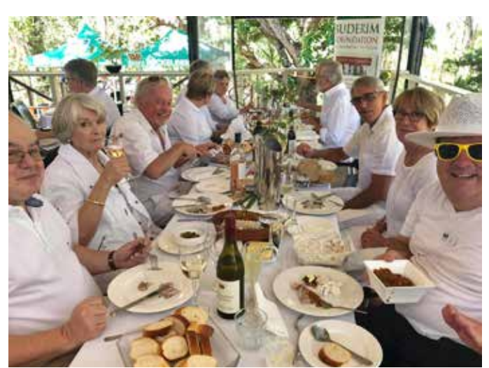
Guests enjoying Lunch en Blanc!

Our particular thanks to Event Sponsors Garland Waddington Solicitors and Bloomhill for supply of the venue.