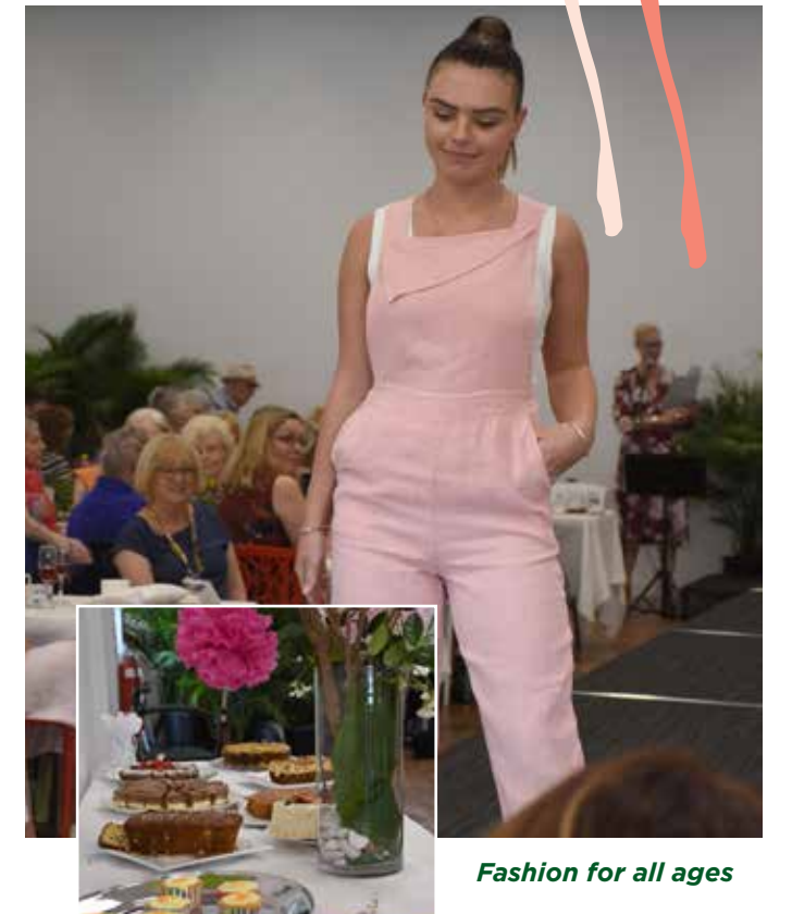
Beautiful food donated by a wide range of Foundation ambassadors