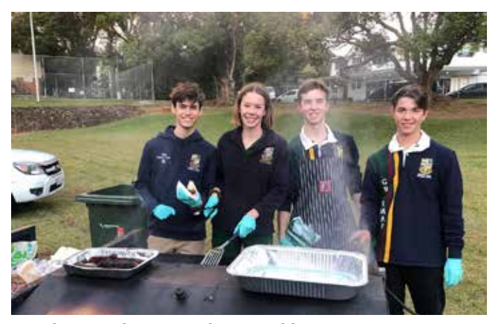
Youth Committee members cooking up a 'sausage sizzle storm'!