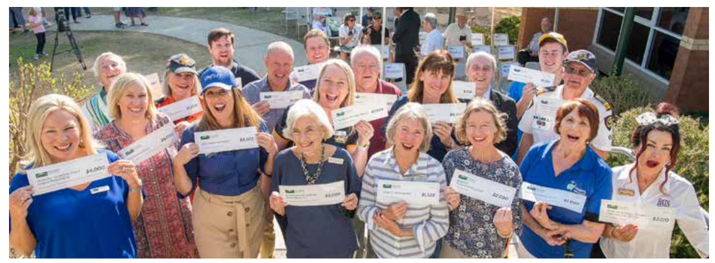
Nineteen very pleased grant recipients